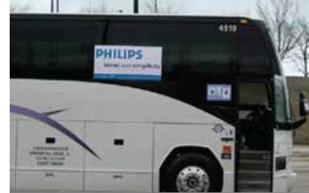
COACH WINDOW SIGNS 4'w x 2'h signs on one or multiple windows on entry or both sides of the bus.