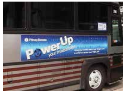
COACH SIDE RIBBONS 2'h ribbon signs belt the side of the bus. Available in 36' printed vinyl or 10', 20' or 30' laminated sign lengths. Effectively brand the bus on the entry side or both sides for maximum exposure.