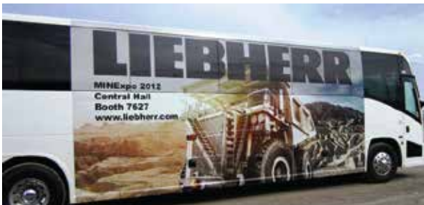
KING BUS WRAPS Abbreviated wrap between the wheel wells provide extreme visibility from both sides of the bus.