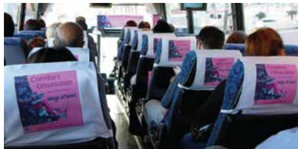
HEADREST COVERS 20 rear facing covers per bus with crisp white linen covers on aisle seats with same 7" x 7" color ad.