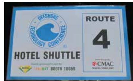
ROUTE ID SIGNS Color logo and booth number at the entrance of all buses.