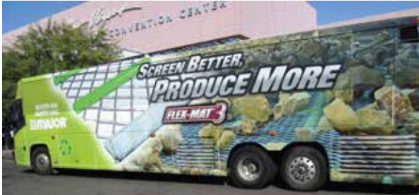
FULL BUS WRAPS The ultimate high impact way to promote your company. These buses are literally huge traveling billboards.

For more information please contact: expomarkit Media Group at 1-205-332-1413 x101 info@expomarkit.com