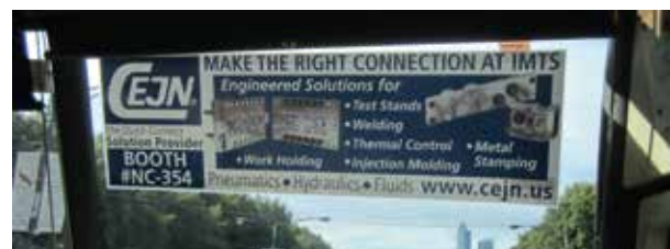
INTERIOR VISOR SIGNS 40" w x 12" h full color placard displayed over the right windshield facing all seated and exiting passengers.